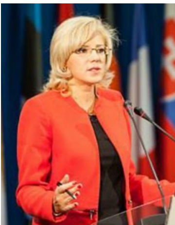
Corina CRETU , former EU Commissioner

Corina Cretu has a long experience as a Member of the European Parliament. Political expert and commentator, she entered the European Parliament as Observer in 2005. During the last mandate (2019-2024) she was a member of the Committee on Budgetary Control as well as of the Committee on Regional Development and member of the Delegation to the EU-Turkey Joint Parliamentary Committee.