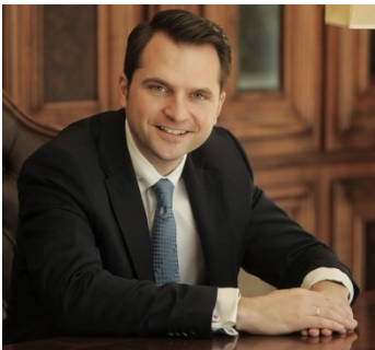
Sebastian BURDUJA , Romanian Minister of Energy