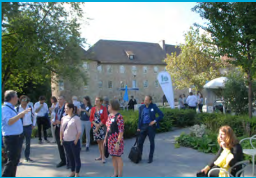
METREX tour Remstal Garden Show in Stuttgart

“We are convinced that the challenge today is to allow everyone, in particular those with the least prospect of employment and housing, thus the most vulnerable, to be recognised, protected and respected,”