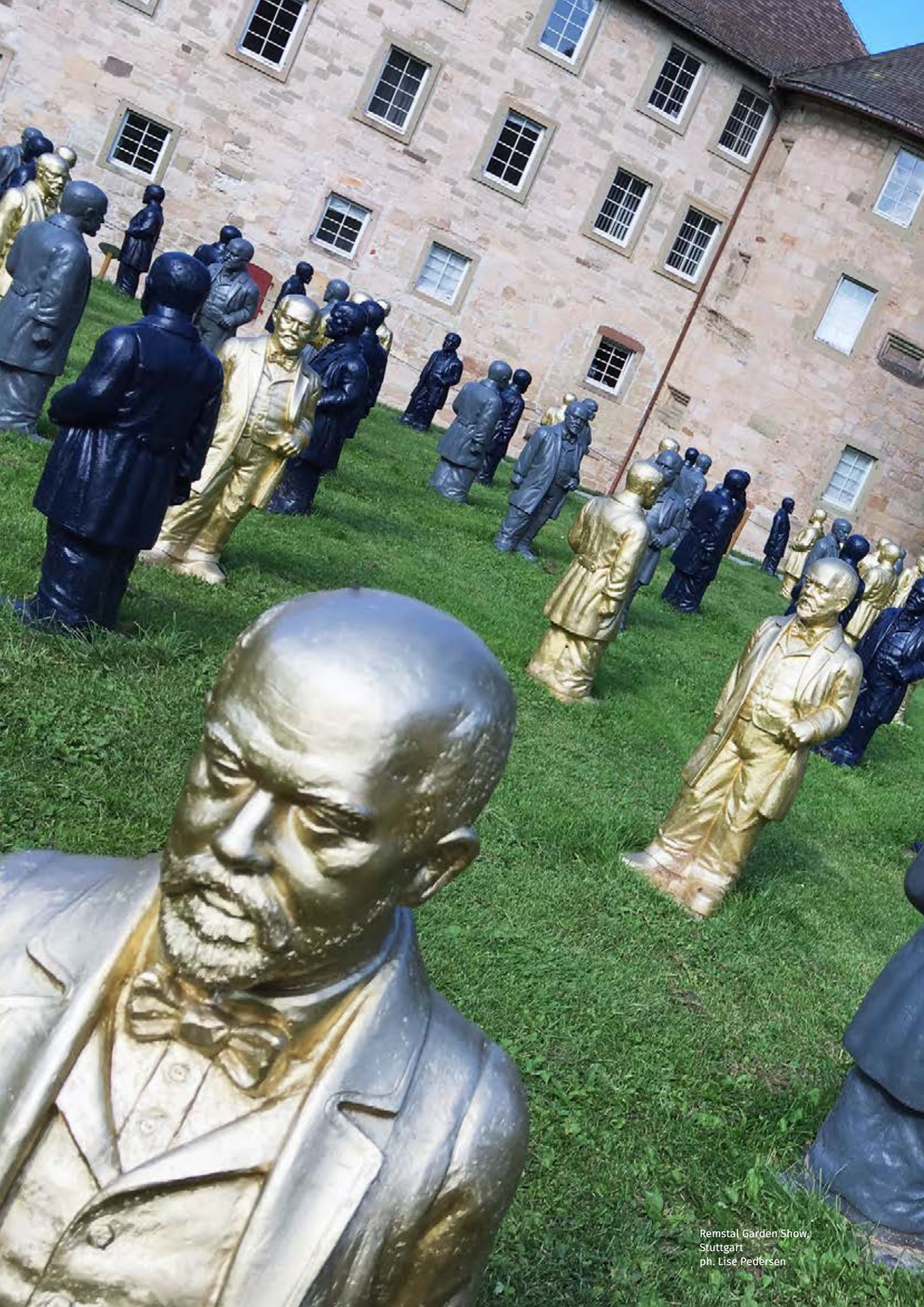
Remstal Garden Show, Stuttgart