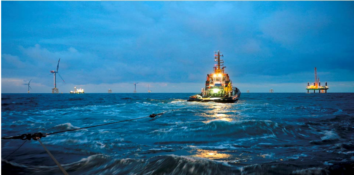
Hamburg offshore wind

The majority of the products used tonight are regional products, as a way of helping to ensure that the conference is carbon neutral.