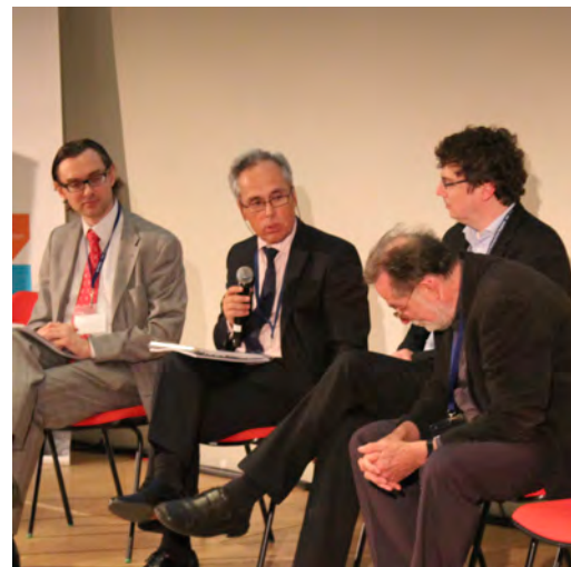
Metropolitan Dimension Forum