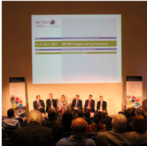
Scotland and Glasgow Forum