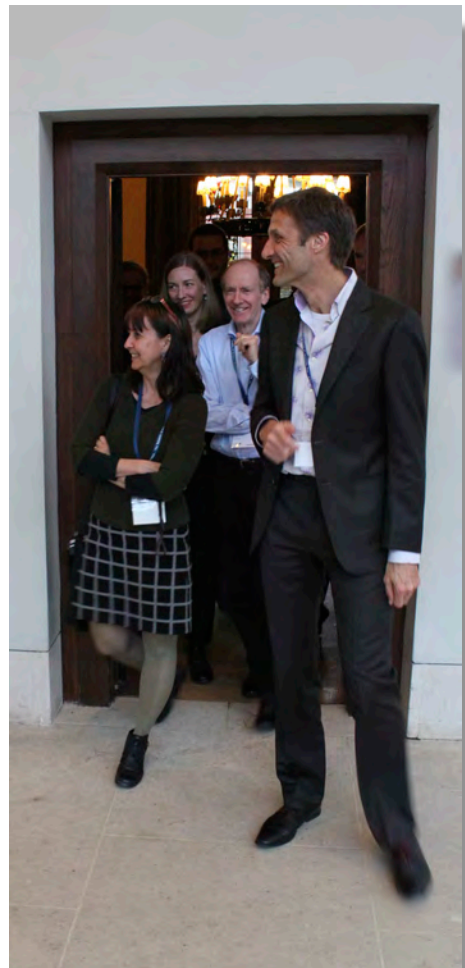
Work life balance at the Burrell