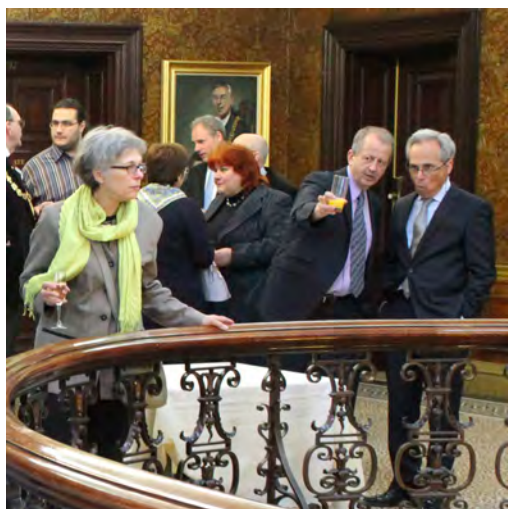
Reception at the City Chambers