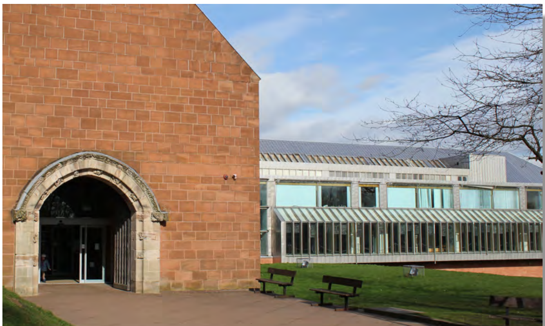
METREX Glasgow 2013 Spring Conference at the Burrell Collection