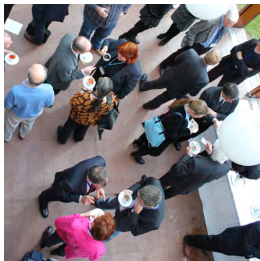
A break at the Burrell