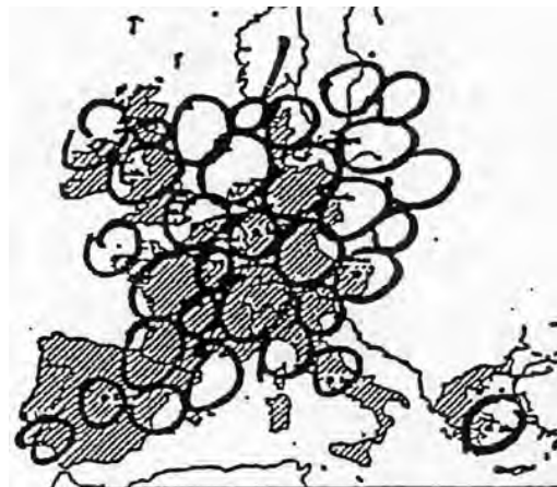
Europe - A bunch of [green?] grapes