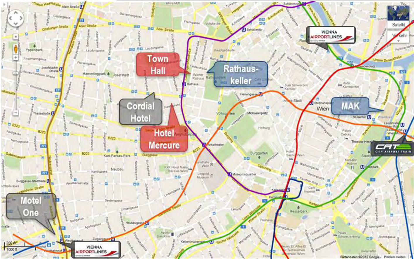
Conference venues and hotels