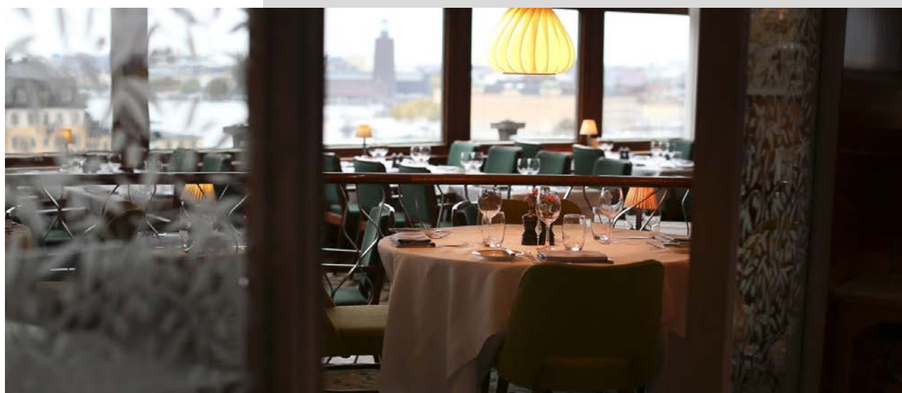
Eriks Gondolen, Stadsgården 6