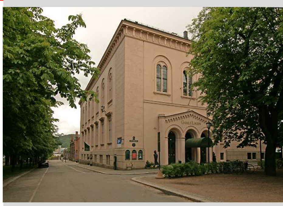
Gamle Logen (The Old Lodge) - Grev Wedels plass 2, 0151 Oslo