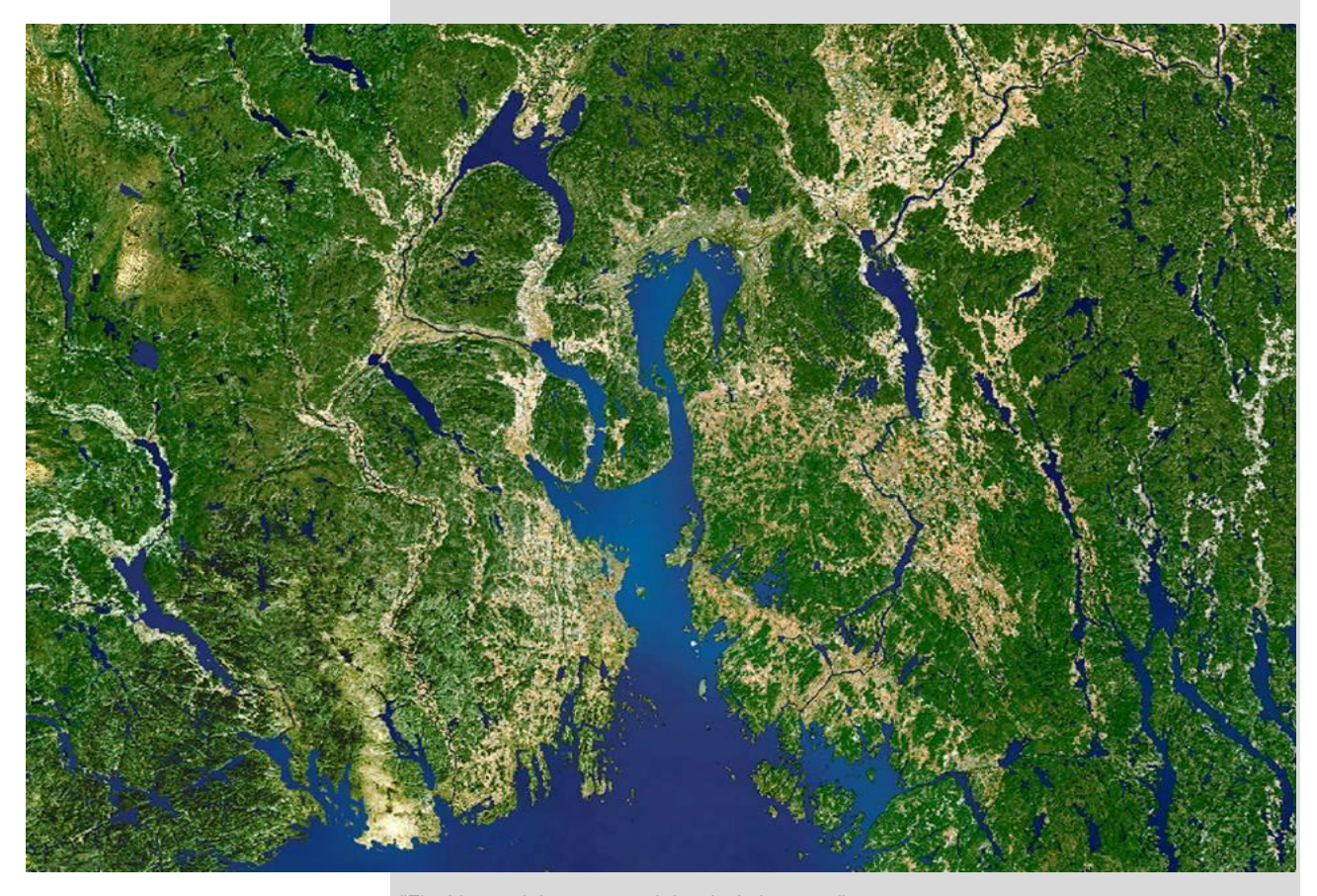
"The blue and the green and the city in between"