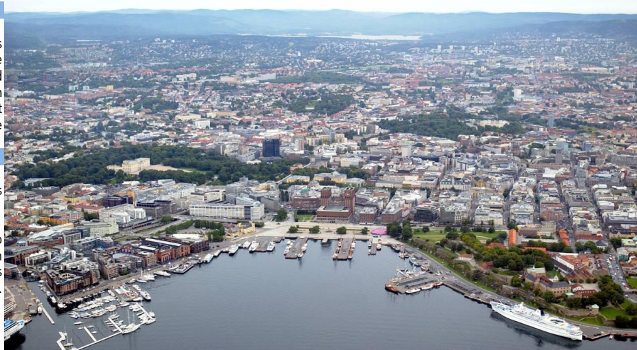
Changing the waterfront

565 000 inhabitants A green, fast growing and diverse region with everything from pleasant coastal areas and agriculture to small cities, the biggest airport in Scandinavia and the headquarters for several multinational companies.