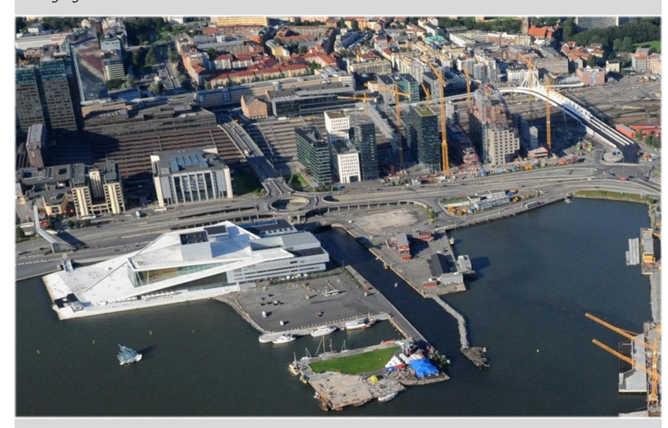
Investing in culture