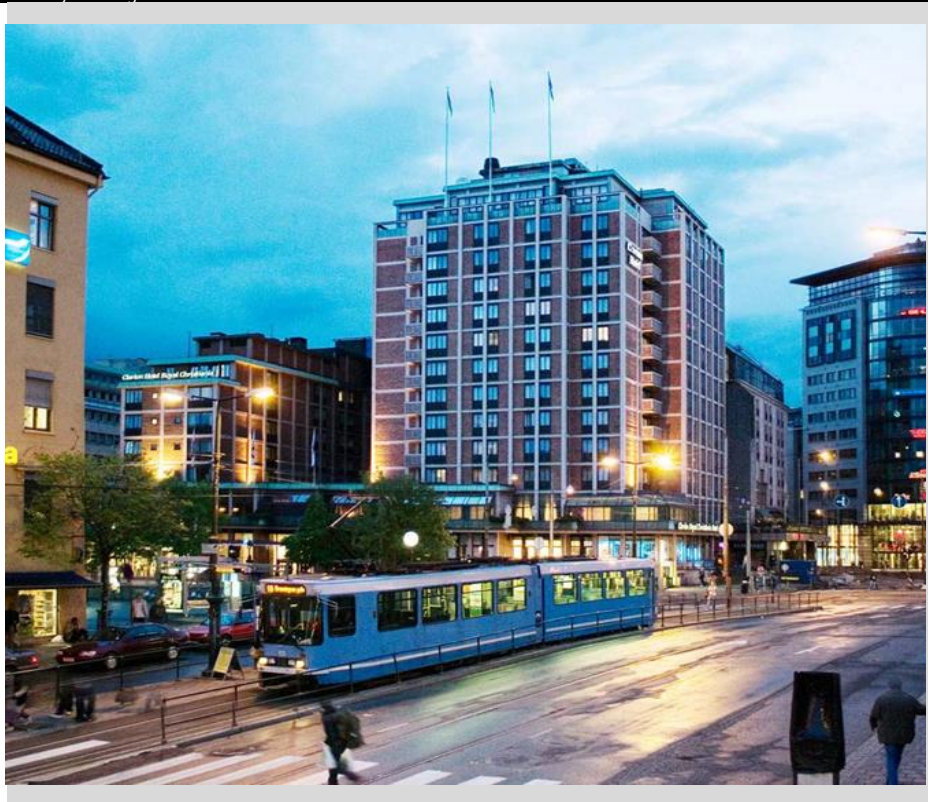
Clarion Hotel Royal Christiania