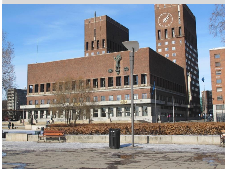
Oslo City Hall