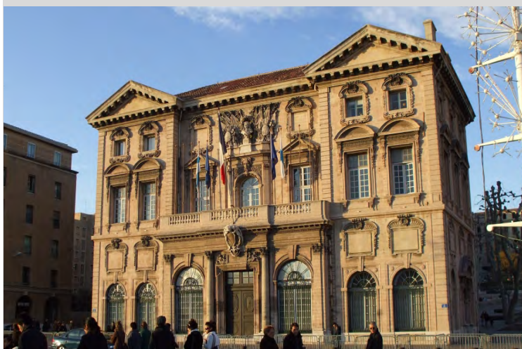
Marseille Town Hall