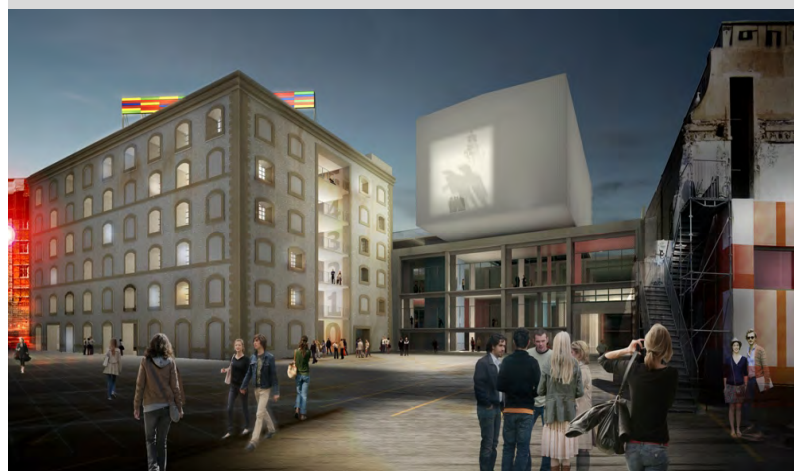
Friche Belle de Mai ©ARM Architecture