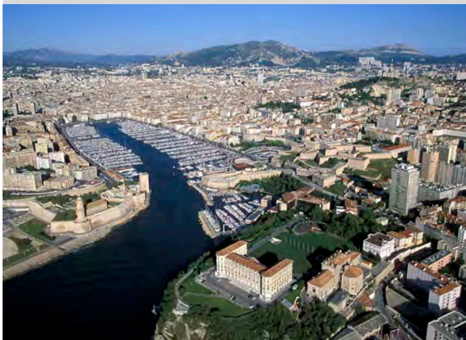
Marseille Vielle Port

Phone 00 44 (0)1292 317074 Email roger.read@eurometrex.org Website www.eurometrex.org