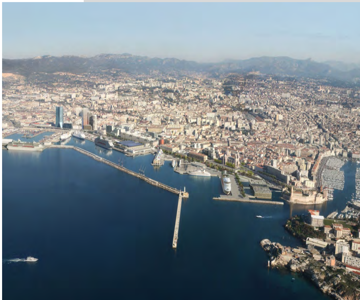
View of the future waterfront @EPAEM -Euromediterranée