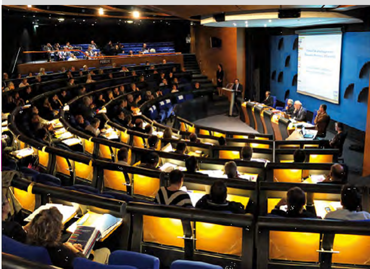
Pharo conférence venue