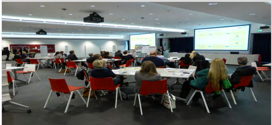
Format for METREX Expo sessions - Sala Biagi Conference suite

The METREX Spring 2015 Conference will include provision for METREX Expo Exemplar sessions and open discussions to feature 5 Exemplars