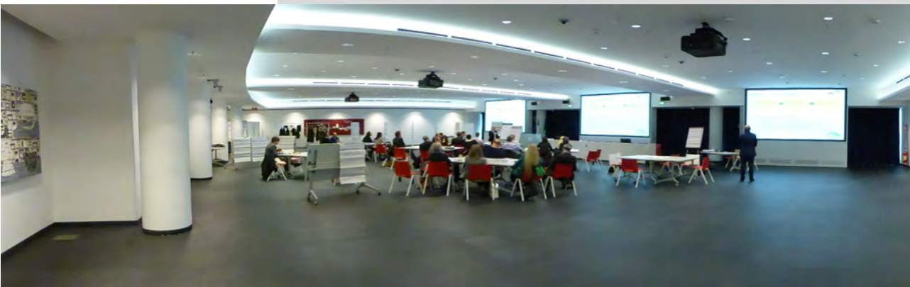
Sala Biagi Conference suite