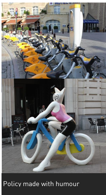
Policy made with humour

Venue details are shown in this Programme.