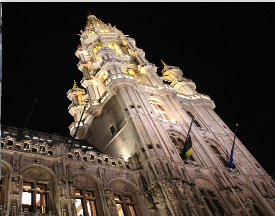
Brussels City Hall