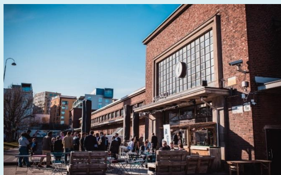
Conference Dinner, Kellohalli