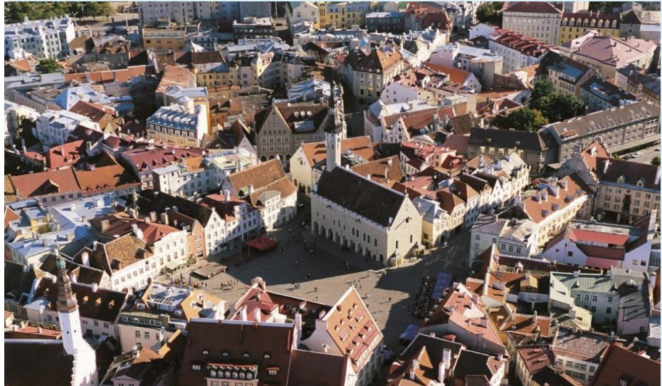
Tallinn City Tourist Office & Convention Bureau/Toomas Volmer