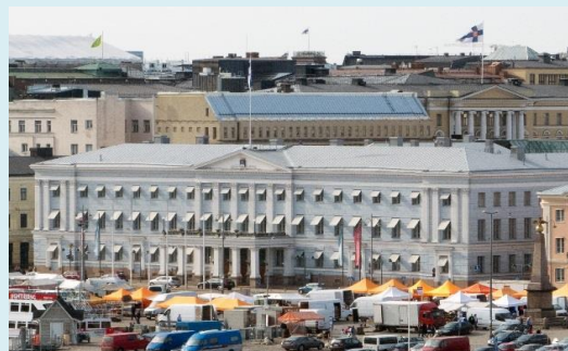
The Old City Hall

(from the Senate Square, bring your badge /invitation with you) Deputy Mayor of Helsinki, CEO Uusimaa Region, CEO HSY & Vice Presidents of METREX Cocktails and buffet