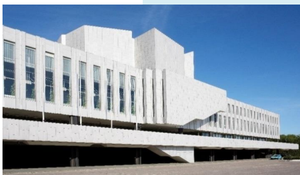
Conference Venue Finlandia Hall Finlandia Hall/Katri Pyyönen

Comments & discussion by METREX panel A - reflections from Europe Naples/Italy, Stuttgart/Germany and Amsterdam/Netherlands