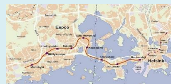
New metro development