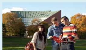
Aalto University Campus, Otaniemi