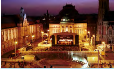
Chemnitz Theaterplatz, Opera Kunstsammlung Chemnitz