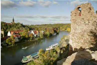
Halle (Saale) Burg Giebichenstein

Dessau-Rosslau can pride itself on no less than three UNESCO natural and cultural world heritage sites. However, this twin city on the Elbe and Mulde rivers has much more to offer. The Federal Department of the Environment is also located here. Today the main features of Dessau-Rosslau as an industrial location are mechanical engineering and vehicle construction, the building industrie and pharmaceuticals.