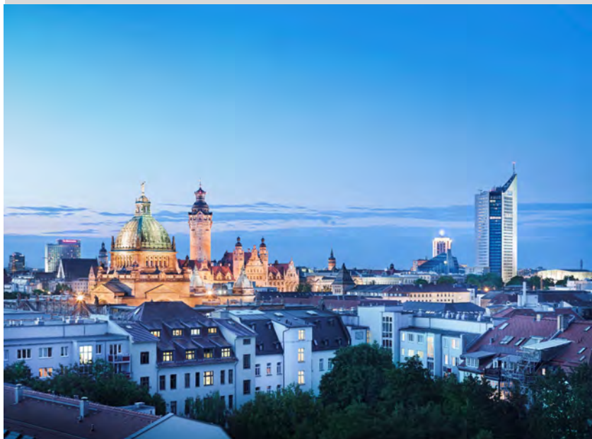
Skyline Leipzig