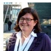
Annette Solli, County Mayor, Akershus